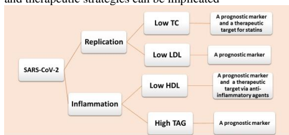
Figure 2: The main hypothesis of the review