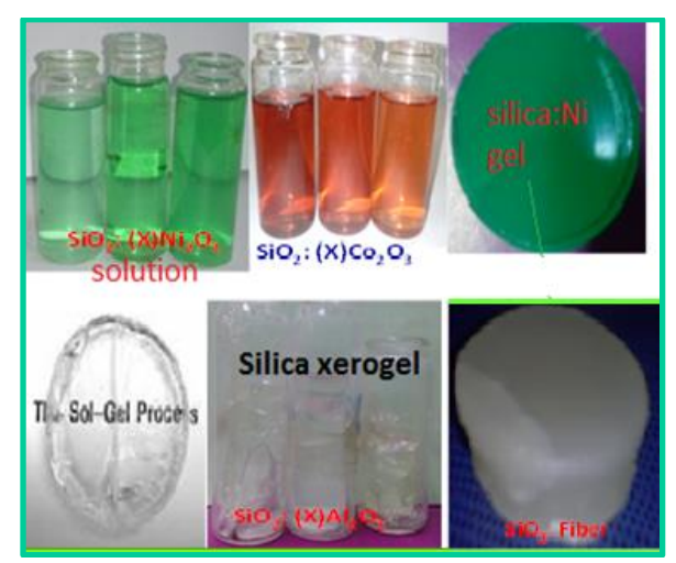
Fig.2 Reaction scheme of sol-gel process form sol-gel -xeogel.

The sol gel process also makes possible preparation of materials that are hard to produce by conventional methods because of some problems associated with the synthesis processes as high melting temperatures, volatilization or crystallization. Different factors may influence in the sol-gel process such as: H_2O/Si molar ratio, nature of the solvent, pH, type of catalyst, temperature, chemical additives. Finally, the sol-gel approach is adaptable to producing glasses and fibers as well as bulk pieces as in the Fig.2.