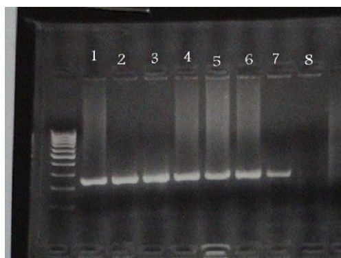
Dilution of a high viraemia case ( 2.5 \times 10^6 copies/ml. Positive bands from 1 to 7 which have dilutions of 10^5 , 10^4 , 10^3 , 500, 250, 100 and 50 copies/ml, respectively.

Sensitivity of the technique was determined by studying the products of PCR at serial serum dilutions. Serum of an HCV infected patient with viral load of 2.5 \times 10^6 copies/ml and serum of a healthy HCV negative volunteer were used. At first 100 \mu l of patient's serum were added to 150 \mu l serum of a healthy HCV negative volunteer to obtain 1 \times 10^6 copies /ml dilution, then 20 \mu l out of this dilution were added to 180 \mu l of HCV negative serum giving rise to 1 \times 10^5 copies/ml and so on resulting in 1 \times 10^4 copies /ml and 1 \times 10^3 copies/ml. Then equal volumes (of the diluted and negative samples) resulted in a dilution of 500 copies/ ml which was repeated giving rise to 250 copies/ml. Out of this dilution 100 \mu l were added to 150 \mu l of HCV negative serum resulting in 100 copies/ml then, 100 \mu l: 100 \mu l of negative sample resulted in dilution of 50 copies/ml. Dilutions of saliva of the same patient was also performed after HCV RNA extraction. The detection limit of the technique was 50 copies/ml as shown in the following figure.